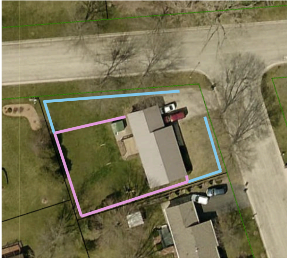
Corner Lot Example

— = 4 foot fence (Front and Street-Side Yards) — = 6 foot fence (Rear & Side Yards)