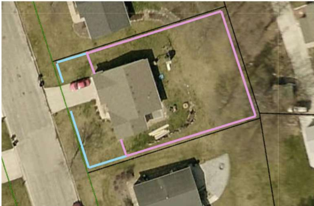
Mid-Block Lot Example

— = 4 foot fence (Front and Street-Side Yards) — = 6 foot fence (Rear & Side Yards)