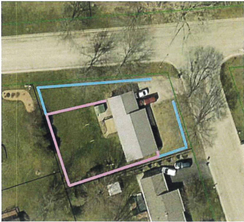
Corner Lot Example

— = 4 foot fence (Front and Street-Side Yards) — = 6 foot fence (Rear & Side Yards)