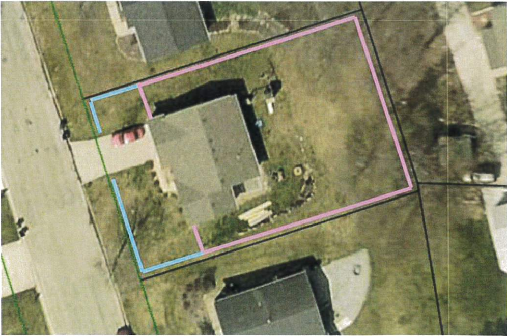
Mid-Block Lot Example

— = 4 foot fence (Front and Street-Side Yards) — = 6 foot fence (Rear & Side Yards)